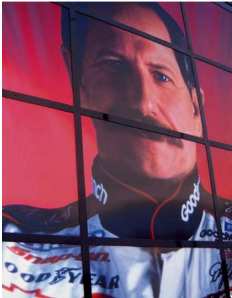
Dale Earnhardt's image in CeeLite

In 2004, Coca Cola wanted to pay tribute to NASCAR racing legend Dale Earnhardt while introducing its C2 product at the Daytona International Speedway, the site of Earnhardt's deadly crash. OPTIKA Scenicworks, hired to conceptualize the sign design and determine how to activate the graphics for 24-hour exposure of an operating and moving 18-wheel truck, turned to CeeLite™ as the lighting solution. The main obstacle? Time. CeeLite had a mere two weeks to execute, deliver and cover the truck.